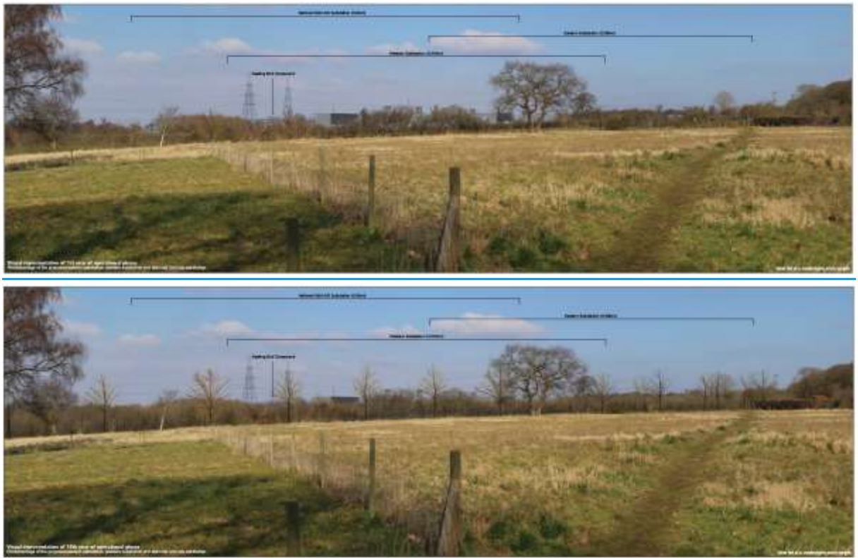
Plate 4.3 Example of the screening provided by the OLMP in local view from edge of Friston (bottom image at Year 15)