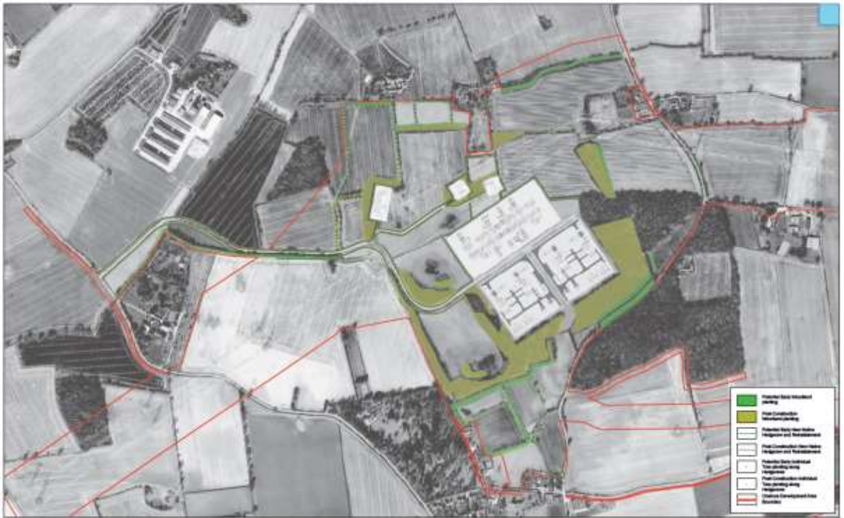
Plate 4.2 Outline Landscape Mitigation Plan (OLEMS (document reference 8.7))